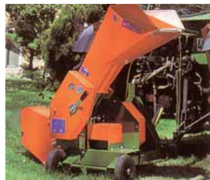
Profi-Häcksler 300K1, M3200S