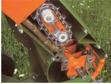
Material to be chopped is charged via an intake belt