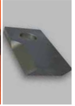
Mallet with cutting edge